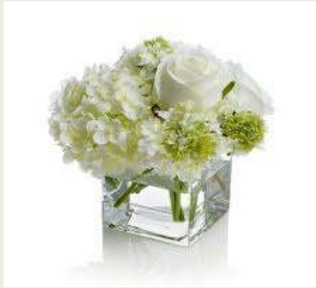
Floral Centerpieces with Seasonal Flower $15.00 and up