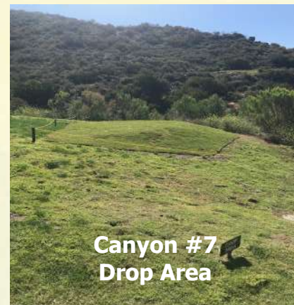
Canyon #7 Drop Area

We also brought in a tree service company to do some tree work throughout the course. The Oak tree on the left side of Canyon #1 needed to get removed because its roots were encroaching into the green and it kept disrupting the smooth putting surface of the green. Then we had them trim back trees to clear the drives on the back tees on Canyon #4, Vineyard #1 and #4. Then most of the tree line on the right side of Vineyard #5 was also trimmed to bring in more sun light to the area along the cart path to keep it dryer and let the Bermuda grass grow in.