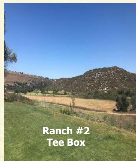
Ranch #2 Tee Box