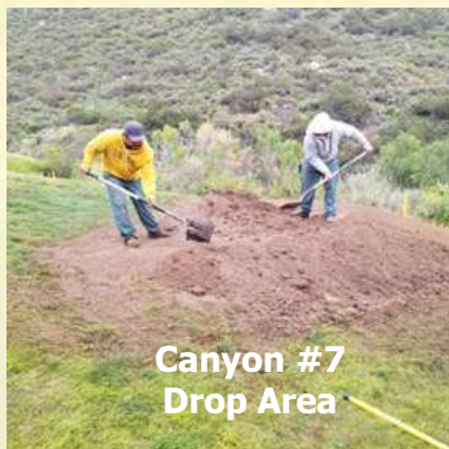
Canyon #7 Drop Area